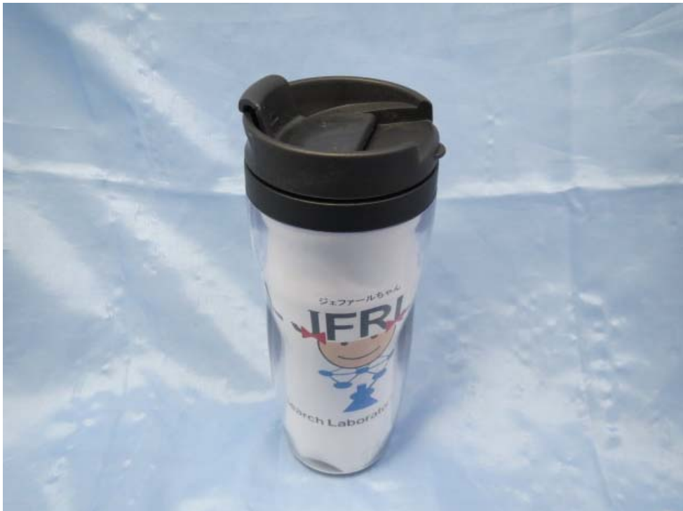
Color photo of the product appearance